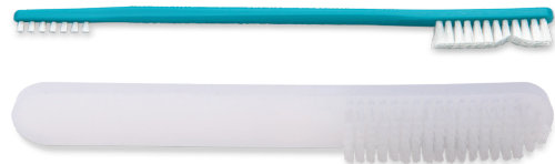
TOOTHBRUSH-STYLE CLEANING BRUSHES